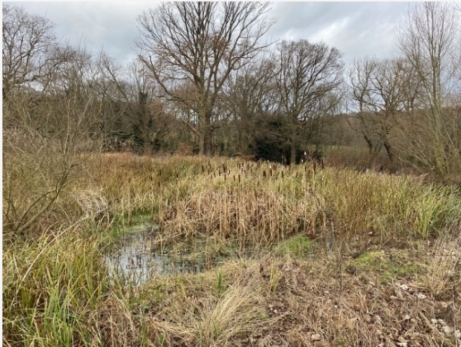
Tumulus Field Pond (Meg's Pond) 2010