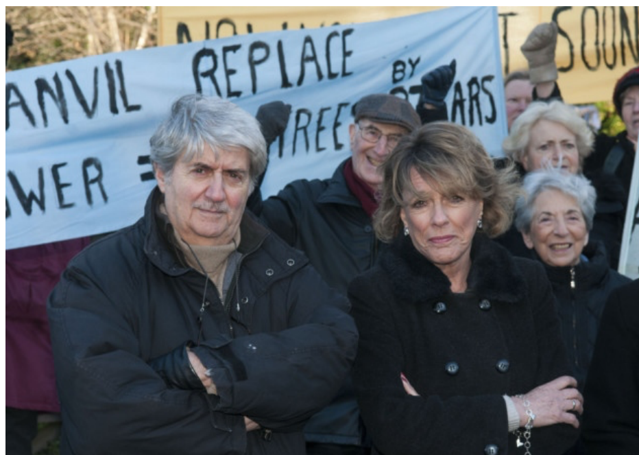
Tom Conti and Esther Rantzen oppose plans to build an underground car park on a nature site

Television presenter Esther Rantzen and actor Tom Conti joined a protest against plans to turn a Grade II-listed Hampstead wildlife oasis into an underground car park and housing development.