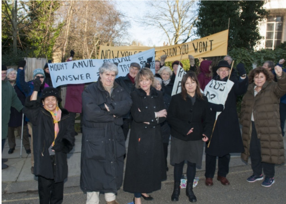
Esther Rantzen and Tom Conti with protesters in Kidderpore Gardens

More than 200 people have signed a petition to halt the scheme on the former King's College site in Kidderpore Avenue.